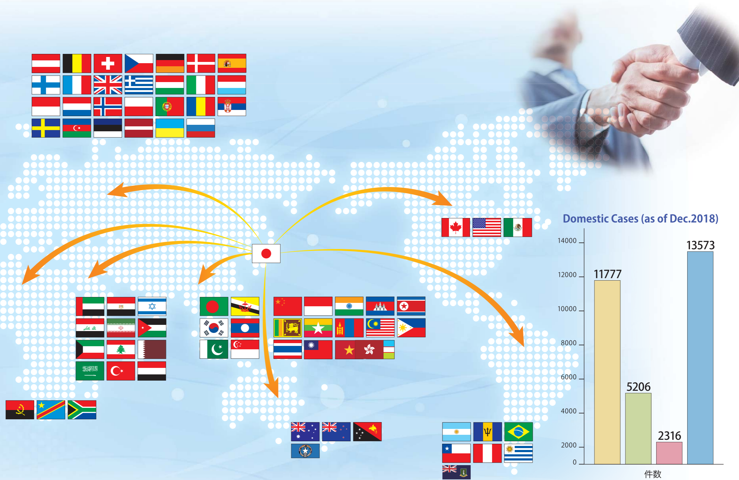
Domestic Cases (as of Dec.2018)